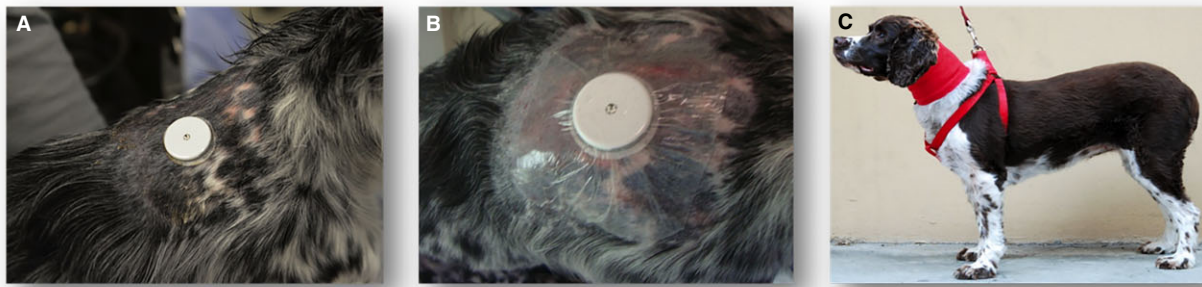
Fig 2. (A) The sensor is applied on the neck of the dog; (B) with extra-tape to secure it on the skin surface; and (C) a bandage was used as an additional security.