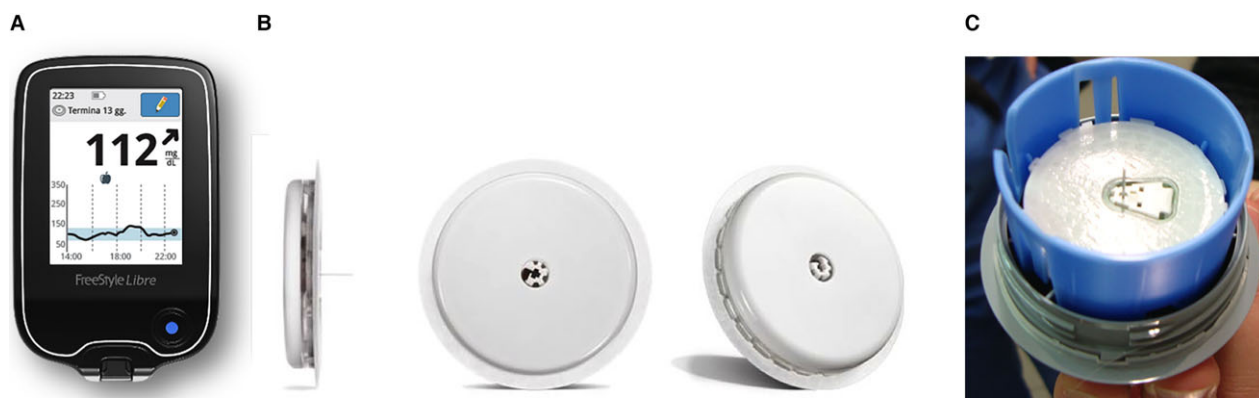
Fig 1. FreeStyle Libre FGMS is composed of the following: (A) the reader that in one-second shows the glucose reading; (B) the sensor that with a small catheter measures the interstitial blood glucose in the subcutaneous tissue; and (C) the sensor is applied on the skin by the provided applicator.

During the wearing period of the sensor, each dog was evaluated for 3-time periods as follows: from the 1st to 2nd day, from the 6 to 7th, and from the 13 to 14th day. During every evaluation period, that lasts 36 hours, blood samples were collected simultaneously every 2–3 hours from cephalic intravenous catheter previously placed. Mean (SD) number of samples, obtained during the 1st–2nd, 6–7th, 13–14th were 16.5 (12.4), 17.8 (6.5), and 16.6 (4.0) respectively.