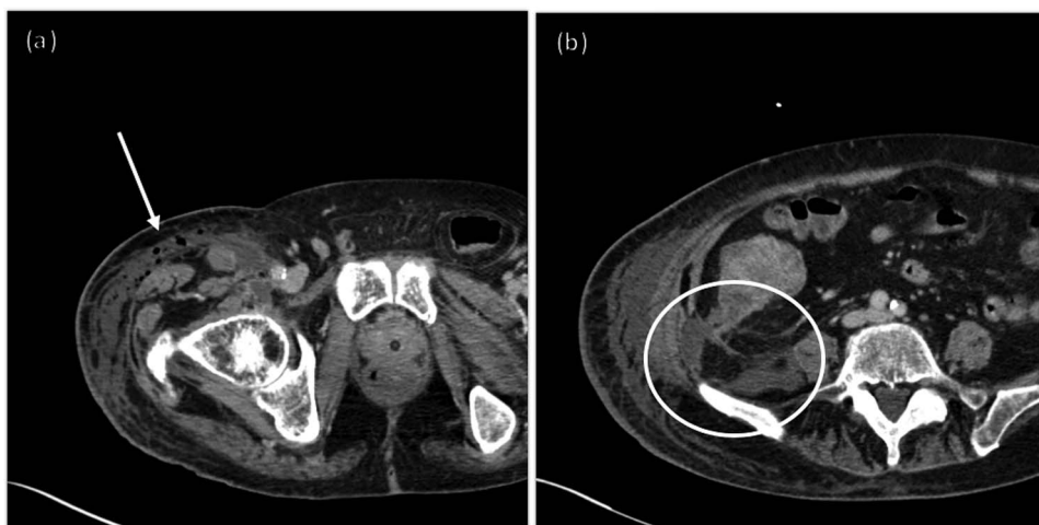
Figure 1: CT of the right hip with intravenous (IV) contrast.