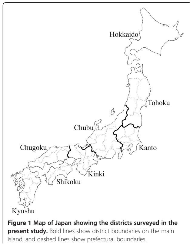
Table 1 Results of the nationwide genotyping survey of GM1 gangliosidosis in Shiba Inu dogs in Japan

The retrospective survey conducted using information collected over 16 years from 1997 to 2013 revealed 23 affected dogs (A1–A23) and several carriers that were related to these affected dogs. The first affected dog (A1-H), born in the Hokkaido district in 1997, was diagnosed with GM1 gangliosidosis histopathologically and biochemically [2], which was confirmed by molecular analysis using stored DNA and RNA [3]. Since this case, other affected dogs with the same molecular defect have been diagnosed sporadically until recently (Figure 2). Of the 23 affected dogs identified, 19 dogs were born within the last 7 years. The pedigree relationships among these affected dogs and the native district of each dog are