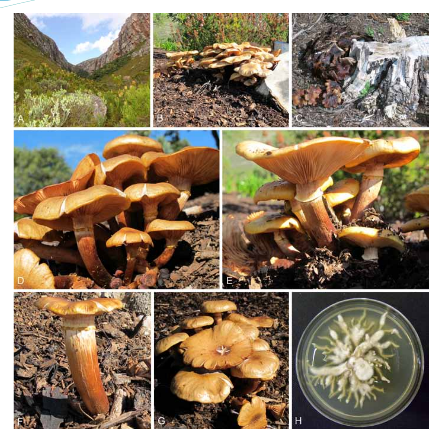
Fig. 1. Armillaria root rot in Kirstenbosch Botanical Gardens. A. Native woody shrubs and forest deeper in the valleys common on the Cape Peninsula. B, C. Clusters of fruiting bodies found on a stump. D–G. Robust fruiting bodies of Armillaria sp. showing a yellow cap, prominent annulus and stipe tapering down to the base. H. Rhizomorphs produced in culture.

of Kirstenbosch Botanical Gardens and close to Rycroft's Gate. These sporocarps could be physically linked to the roots of unidentified dead trees and Protea spp. (Fig. 1B, C). Upon removal of the bark from the dead roots, sheets of white mycelium typical of Armillaria root rot were found. The aim of this study was to identify the Armillaria sp. found fruiting in Kirstenbosch using data that were not available at the time of the discovery of Armillaria root rot in Cape Town (Coetzee et al. 2003b).