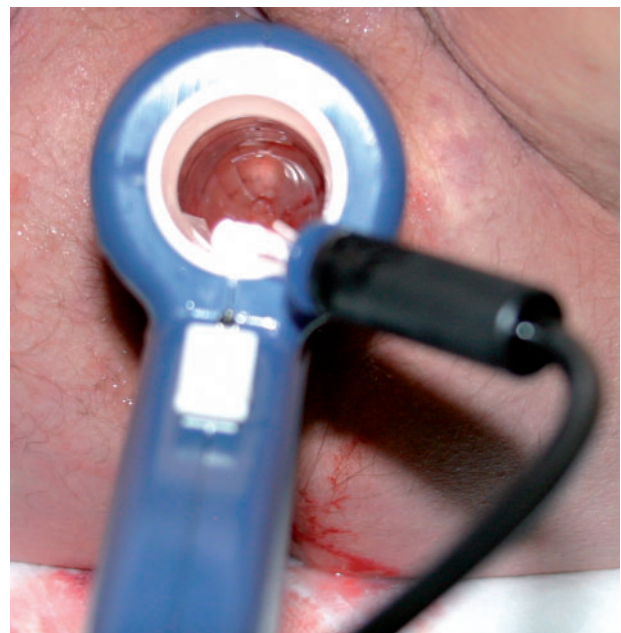
Figure 2. Probe application.

The SECCA procedure is generally performed under local anaesthesia and intravenous conscious sedation by means of fentanyl and midazolam. Antibiotics are generally administered and are aimed at Gram-rod and anaerobic bacteria. One or two hours prior to the procedure, patients are given a rectal enema. Patients are examined supine in the lithotomy or jack-knife position. The SECCA device is introduced into the anal canal, allowing good visual control of electrode placement. Once the applicator is satisfactorily in place, RF energy is delivered via four needles circumferentially in four quadrants at five different insertion levels each at 0.5 cm commencing at the dentate line upwards. The RF generator delivers energy at 465 kHz, 2–5 W, at each needle electrode for 90 seconds and power is automatically switched off when the temperature exceeds 85°C. The mucosa is constantly cooled by chilled water (45 mL/min) at the base of each needle. Each needle causes formation of five thermal lesions. This results in a total of 20 radiofrequency deliveries with 80–100 thermal lesions. The whole procedure takes about an hour. The technique is shown in Figures 1–3.