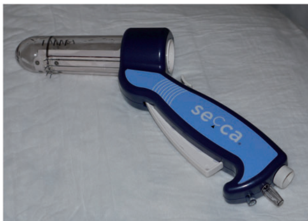
Figure 1. Secca® handpiece (probe).

The SECCA procedure, which involves the administration of temperature-controlled RF energy to the anal canal, was first used for the treatment of AI in Mexico in 1999 by Curon Medical (Fremont, Ca, USA). The RF procedure, STRETTA, had previously shown a therapeutic effect in the treatment of gastro-oesophageal reflux. In 2002, the Food and Drug Administration (FDA) of the United States approved the SECCA system for use specifically in the treatment of patients with AI to solid or liquid stool, occurring at least once per week, and who already had failed to respond to more conservative therapies. According to the guidelines