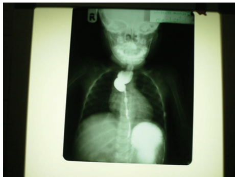
FIGURE 1: Preoperative barium swallow/meal of a child with corrosive oesophageal stricture.