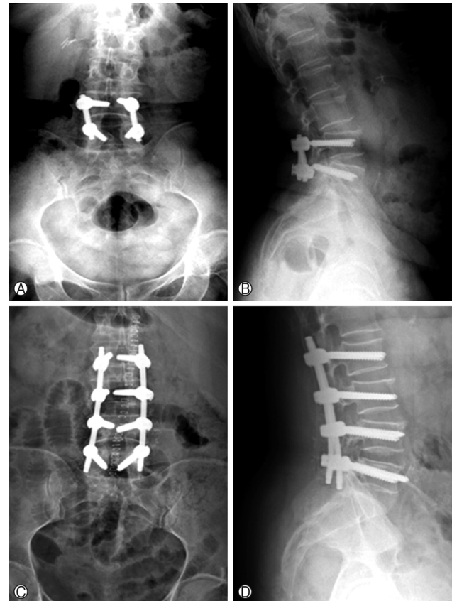
Fig. 2. (A) Anteroposterior (AP) radiograph of a patient operated on for spinal stenosis, (B) Lateral radiograph, (C) AP radiograph after revision surgery, (D) Lateral radiograph.

the screw was placed in the U-section (Fig. 2). The cap screw was tightened on the screw, and the screw was fixed in the end section of the apparatus. The polyaxial screw that became monoaxial can be removed by turning the handles on the shaft. Thus, the need for metal cutters and extra time and effort is avoided. This method also removes the need to clean the fibrous tissue covering the internal screws and to see the screw shape.