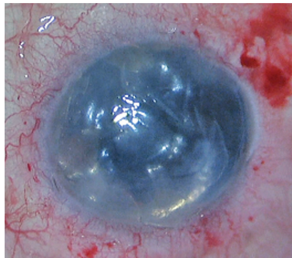
Figure 1. Graft position of case 1 at the end of surgery

The postoperative period was uneventful for both patients, with no DEC detachments requiring rebubbling. Both eyes had improved corneal clarity (Figure 2) and increased BCVA at 6 months. BCVA at 1 month and 6 months was 0.5 and 1.0 (with a -3.0 D cylinder) for case 1, and 0.2 and 0.6 (with a -2.0 D cylinder) for case 2, respectively. Intraocular pressures of cases 1 and 2 at 6 months were 18 mmHg and 20 mmHg, respectively.