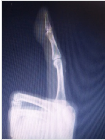
Figure 2: Soft tissue swelling on the palmar aspect of the finger without any bony changes.

the hand. The index finger is the most commonly involved digit followed by the middle, ring, little finger, and thumb [5,8]. The reported case presents the classical features of GCTTS of the index finger.