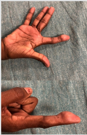
Figure 1: Swelling on the palmar aspect of the index finger.