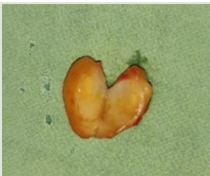
Figure 3: Cut section of the well-defined tumor with fibrofatty tissue.

It is common in the hand, though described in ankle and foot also [1,2,3,4,5]. The foot and ankle GCTTS accounts for 3–5% of all GCTTS in the body, with most located in the hand. GCTTS is seen on the lateral aspect of ankle and dorsum of foot, commonly involving extensor tendons, in which case misdiagnosis is likely. In the hand, it is seen on flexor aspect commonly. Kant et al. [1] reviewed 26 cases of GCTTS with the minimum follow-up for 2 years. He found it most commonly in the age group between 21 and 40 years. He noted bony