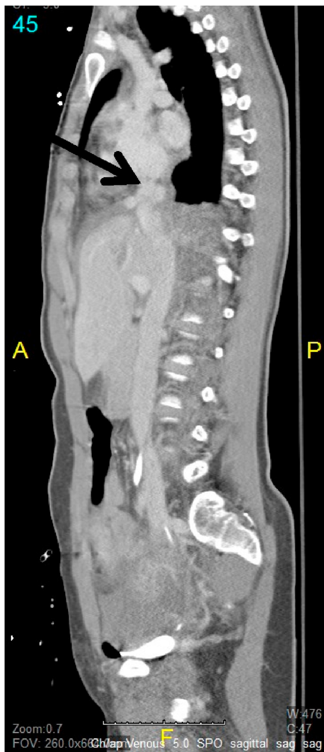
Fig. 2. A sagittal image from the patient's repeat computed tomography study demonstrates stable pseudoaneurysm along the confluence of the suprahepatic inferior vena cava (IVC).

CT, obtained 6 month (Fig. 3) later, demonstrated resolution of IVC pseudoaneurysms.