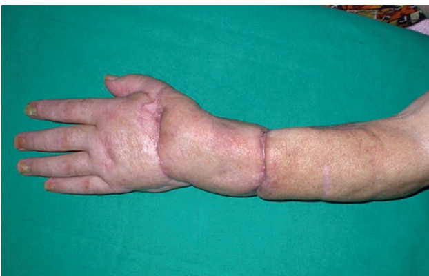
Fig. 2. Three months postoperatively.

The rationale behind this triple-level replantation/revascularization in a relatively old patient was the favorable mechanism of injury, overall health of the patient, and patient request. Retrospectively, this is a debatable decision. A completion-amputation may have expedited the postoperative course and return to daily activities. Besides the functional impairment of a below-elbow amputation, elderly patients are known to adapt less favorably to prosthetic fitting.