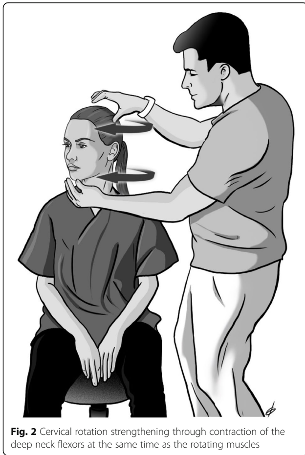
Fig. 2 Cervical rotation strengthening through contraction of the deep neck flexors at the same time as the rotating muscles

also increased immediately after the last treatment ( p = 0.017 ) in Group A, and this increase was greater to that found in Group B. This improvement was not maintained 2 weeks post-treatment ( p = 0.019 ); however, after 4 weeks, the improvement in strength was restored immediately after the last treatment ( p = 1.000 ). No statistically significant differences were found between the two types of therapeutic interventions for any other strength evaluation.