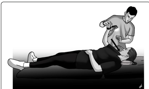
Fig. 1 Strengthening of the deep neck flexors with a combination of a neck curl with a chin tuck

A statistically significant increase in the mean ROM of cervical flexion and extension was found immediately after the last treatment in both groups ( p = 0.002 and p = 0.0005, respectively). Furthermore, the average ROM values were maintained after two ( p = 0.151 and p = 1.000, respectively) and 4 weeks ( p = 0.064 and p = 1.000, respectively) in both groups. Cervical flexion strength