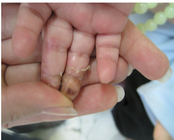
Figure 3. Distal Cyanosis and Scaling in Hands and Gangrene of the Distal Phalanx of the Middle Finger in the Repair Phase

nary aneurysms. He was admitted again. This time echocardiography findings were as follow: LMCA diameter 7.4 mm, RCA 4.3 mm, and LAD 5.2 mm. With continuation of aspirin, warfarin, and azathioprine (for 3 months), second pulse of methylprednisolone and IVIG and Infliximab were given. After a year cardiovascular angiography revealed: 4.5 mm diameter aneurysm in distal LMCA, LAD stenosis and non-appropriate tapering of RCA. His treatment continued with long-term use of low dose aspirin and warfarin for prevention of thrombosis.