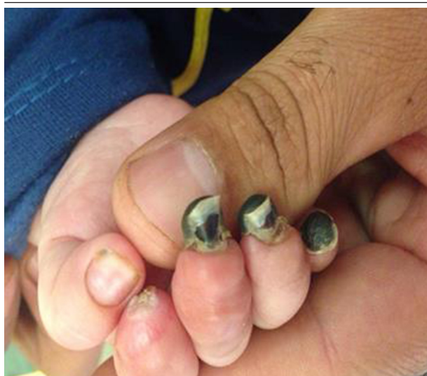
Figure 2. Peripheral Gangrene as a Presentation of Kawasaki Disease