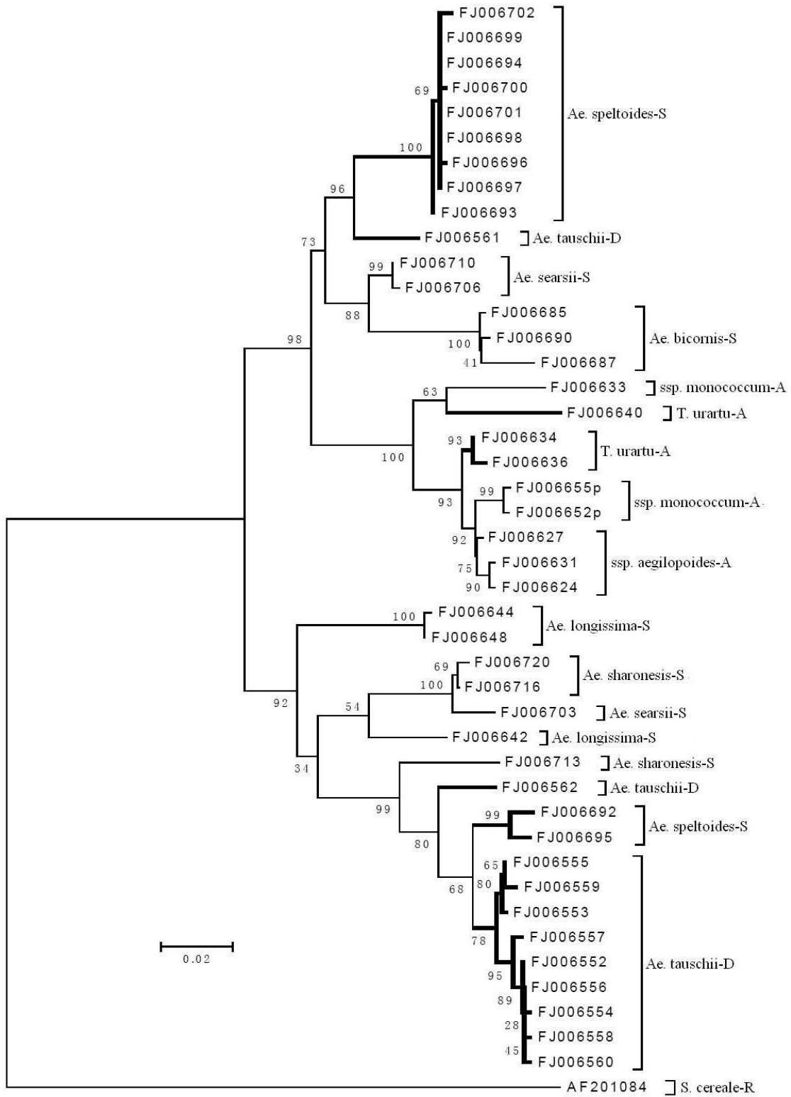
Figure 2 Neighbour-joining tree of the \gamma -gliadin sequences from diploid wheat and Aegilops species. Wider lines indicate the nodes of the three subtrees in Additional File 2; 'p' = pseudogene; AF20184 is the outgroup, which is a 75 K \gamma -secaline gene.