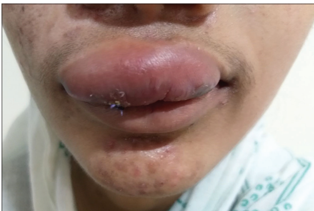
Figure 1: Presentation of patient with swelling on upper lip

After 4 months she visited the ENT, Head-and-Neck Surgery OPD of our institute. On local examination, swelling over the upper lip and bleeding from the nasal floor was observed. No abnormality detected on examination of the neck. Nasal endoscopy was done which showed septal deviation with synechiae present between the septum and left side of the nose. On the right-side crusts were present in the nasal cavity with mucoid discharge. Mass or polyp was absent. Swelling was also present on both anterior and posterior aspect extending up to the ventricular border crossing the midline. It was firm, nontender and nonfluctuant [Figure 1] with the congested posterior pharyngeal wall. The mucosal biopsy was taken from the upper lip with all aseptic precautions and sent for KOH mount, fungal culture.