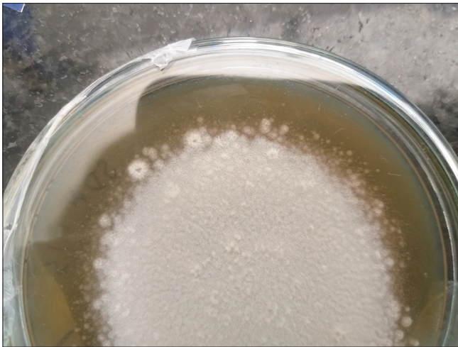
Figure 3: Colony morphology on sabouraud dextrose agar after 3 days of incubation white satellite colonies waxy to powdery