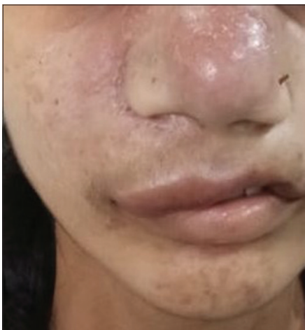
Figure 5: Presentation of patient after recovery

on palpation. Diagnostic nasal endoscopy was done in which fleshy reddish mass occupying the right nasal cavity