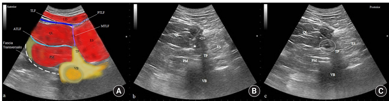
Fig. 2. Anterior quadratus lumborum block. A. (A) Convex ultrasound probe was placed on the iliac crest and in the transverse position to the posterior axillary line. Subsequently, the L4 vertebral body at the L4 vertebra level, along with the L4 transverse process, the quadratus lumborum, the erector spinae, and the psoas muscle, were identified as the Shamrock sign. (B) 21 G (100 mm) peripheral nerve block needle was directed towards the thoracolumbar fascia—from the posterior aspect of the transducer to the posteromedial anterolateral direction between the psoas muscle and the quadratus lumborum muscle. (C) Local anesthetic was injected after confirming the site by hydrodissection.

In addition to the descriptive statistical techniques (frequency,