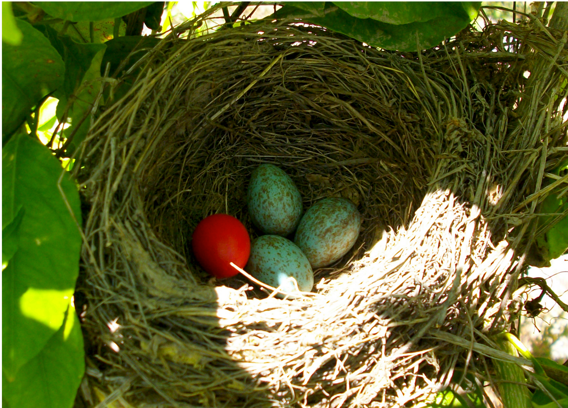
Fig 1. Photo of a blackbird nest containing three natural eggs parasitized with a normal-weight non-mimetic egg.