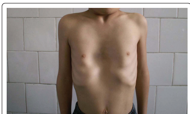
Figure 1 Chest of a 8-years-old boy with asymptomatic PE.

behavioural problems of PE patients by using Chinese Mandarin version of the CBCL, and investigated the risk factors of psychosocial problems by using univariate and multivariate analysis. It was anticipated that children in the control group would report lower frequency of psychosocial difficulties than children with PE. We believe that a better understanding of the features associated with psychosocial problems might improve assessment of emotional risk and assist in the development of intervention and prevention strategies.