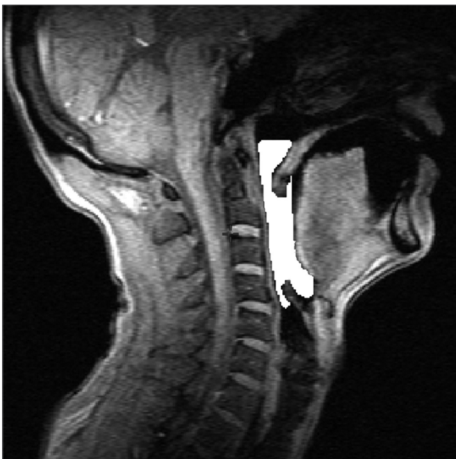
Figure 1. Image showing the PMP area defined superiorly by a line passing along the hard palate to the posterior pharyngeal wall, inferiorly by the back of the vallecula, posteriorly as the posterior pharyngeal wall, and anteriorly as the base of tongue and the soft palate.

The area that was assessed was only the air space; hard or soft tissues were not included. This area was defined on the sagittal plane of the pharyngeal midplane, superiorly by a line passing along the hard palate to the posterior pharyngeal wall, inferiorly by the back of the vallecula, posteriorly as the posterior pharyngeal wall, and anteriorly as the base of tongue and the soft palate (Figure 1). This region was named the pharyngeal midplane (PMP) area. The PMP area was measured pixel by pixel in sagittal images using the abovementioned software, which yields simultaneous views of three orthogonal planes and makes it possible to accurately define the anatomy. It generates a binary file from which the area may be calculated.