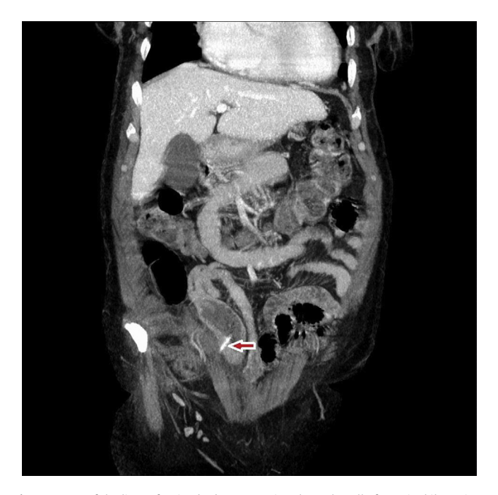
Fig. 1. Image of the linear foreign body penetrating through wall of terminal ileum into the surrounding fatty tissues as seen on the contrast CT.

to the operating room immediately. Laparotomy was performed using a midline incision. A thorough examination revealed a sharp, linear foreign body (fish bone) measuring 5 cm long at the 15 cm proximal of the terminal ileum, which penetrated through the wall of ileum (Fig. 2).