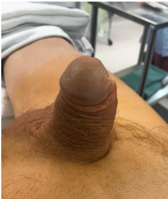
Figure 2. Impending cylinder erosion.

prosthetic cylinder presses under the skin after it has worked its way through or against a weakened tunica albuginea.