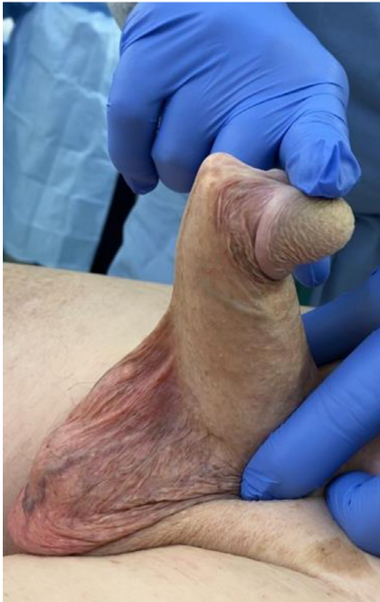
Figure 1. Flail penis, or severe glans hypermobility, secondary to undersized cylinders.