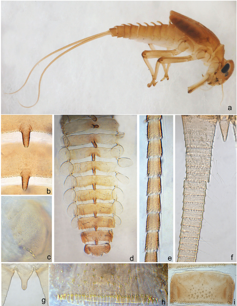
Figure 2. G. baibungensis sp. n. (a–e, g, h), G. narumona (f) and G. sororculaenadinae (i). a habitus of lateral view b protrusion on abdominal terga VI–VII c paraproct d abdominal terga I–X e inner marginal bristles on cerci f inner marginal bristles on cerci g terminal filament h posterior margin of abdominal sterna VIII i sterna VII–VIII.

and approximately one third of tergum length on segment IX; surface of protuberance scattered with scale-like setae (Fig. 2b). Terga surface with scattered scale-like and fine setae, posterior margin with blunt denticles. Surface of sterna scattered with round