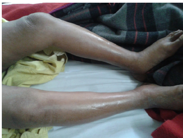
Figure 1. Patient with bilateral lower limb DVT showing edema up to the thigh with overlying shiny skin.

The patient's routine investigations revealed hemoglobin 102 g/L, total leukocyte count 7.300 \times 10^9/L , differential count-polymorphs 0.66, lymphocytes 0.28, eosinophils 0.4, monocyte 0.2, platelet count 63 \times 10^9/L , erythrocyte sedimentation rate (ESR) 56 mm/hour, total serum calcium 2.25 mmol/L, and phosphorus 1.13 mmol/L. Kidney function and liver function tests were normal. Coombs test