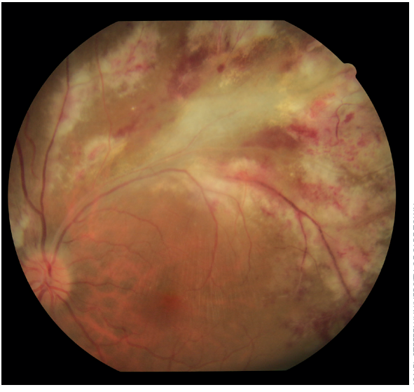
Figure 1b Frosted branch angiitis