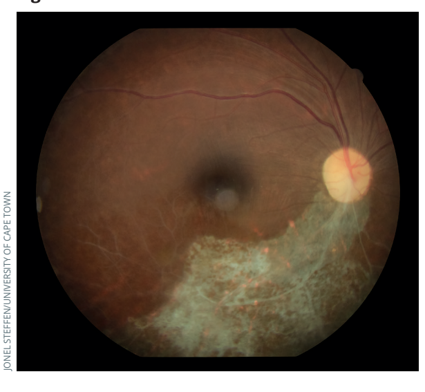
Figure 2 Inactive CMV retinitis

CMV treatment (intravitreal or systemic) may be stopped when all the following criteria are met<sup>1</sup>: