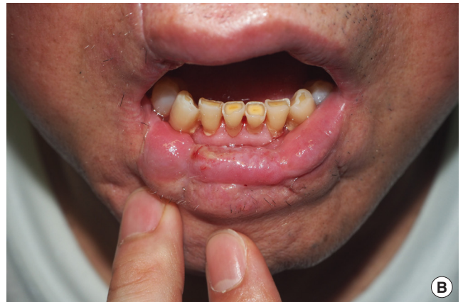
Fig. 4. (A) Three months after Abbe flap coverage, a vermilion apron flap was performed to correct the drooling and whistle deformity of the central lower lip. (B) Result after vermilion apron flap coverage.