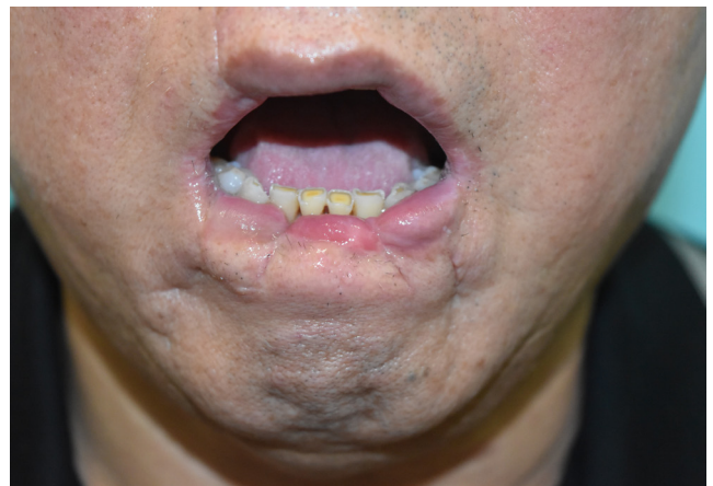
Fig. 5. Result at 6 months after surgery.