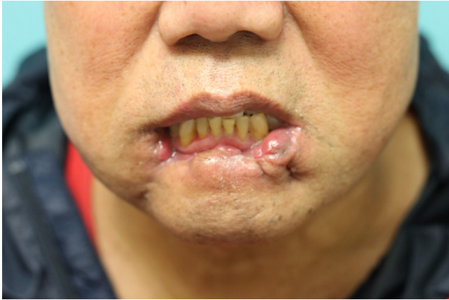
Fig. 2. As a result of extensive soft tissue necrosis caused by acute fungal stomatitis, 3/4 of the entire lower lip was affected, with a full-layer skin defect extending from the vermilion to the gingivobuccal sulcus at the corner of the mouth.