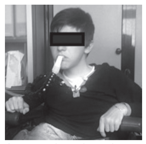
Figure 1. A patient during mouthpiece ventilation.

All of the patients had previously refused to use NIV, but accepted treatment with MPV. The preferred mode was pressure control (Table 1). IPAP was set between 10 and 14 cmH<sub>2</sub>O, which ensured an optimal tidal volume (8-10 mL/kg). No back-up rate was needed during