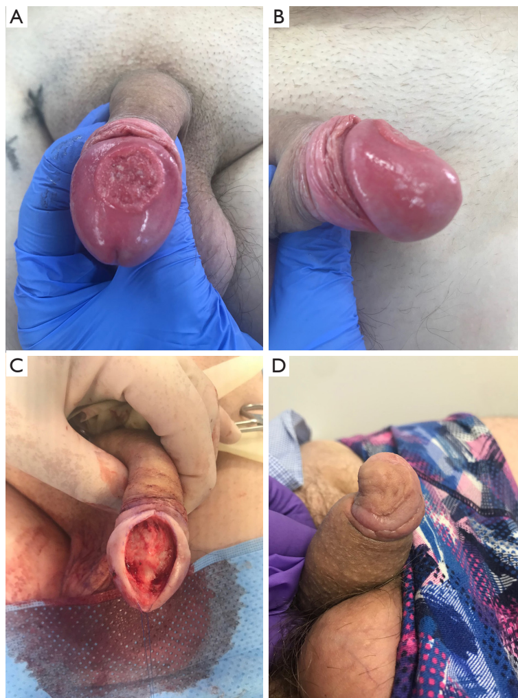
Figure 1 Wide local excision of penile SCC confined to the glans penis. (A) Top down view of the penile SCC pre-operatively; (B) side view of the penile SCC pre-operatively; (C) wide local excision defect which was subsequently covered with split thickness skin graft; (D) post-operative appearance after healing. SCC, squamous cell carcinoma.