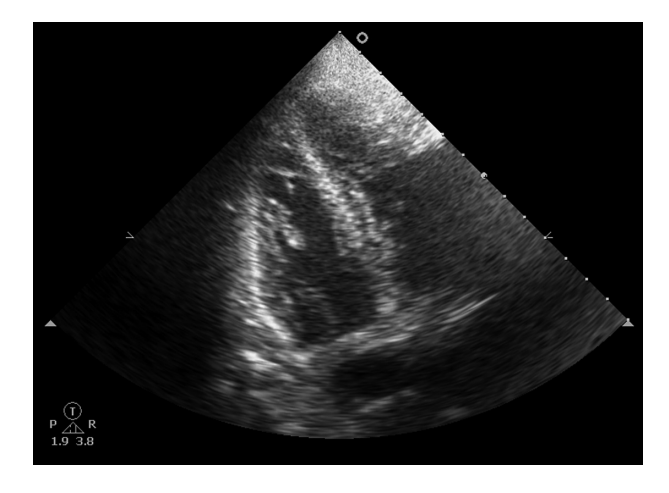
Figure 3. Three headed papillary muscle complex. Note: This is an apical view which demonstrates that the papillary muscle complex consists of a base with a single, tall head flanked by a smaller head on either side.

Aktas et al<sup>8</sup> investigated papillary muscle variants around the tricuspid valve in cases of sudden death. 400 hearts were studied and a great variability in the number of papillary muscles in the right ventricle was found, ranging from two to nine. The authors also observed a striking incidence of conical and flat topped configurations of the posterior papillary muscle in these deaths. The authors concluded that these pap-