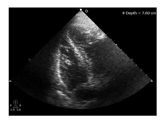
Figure 2. Papillary muscle complex. Note: Another view of the aberrant papillary muscle complex.

Note: This is an apical, four chamber view demonstrating a large papillary muscle complex, with its origin from the lateral wall of the right ventricle.