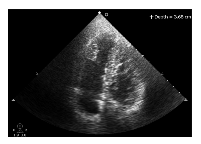
Figure 1. Aberrant papillary muscle complex in the lateral wall of the right ventricle.

They may be the source of cardiac rhythm disorders.<sup>7</sup> Lazzari et al<sup>7</sup> examined the short-term behavior of extrasystoles, arising from the anterior papillary muscle of the right ventricle. 20 subjects were studied with Holter recordings and exercise data. According to the authors a right ventricular anterior papillary muscle extrasystole has a left