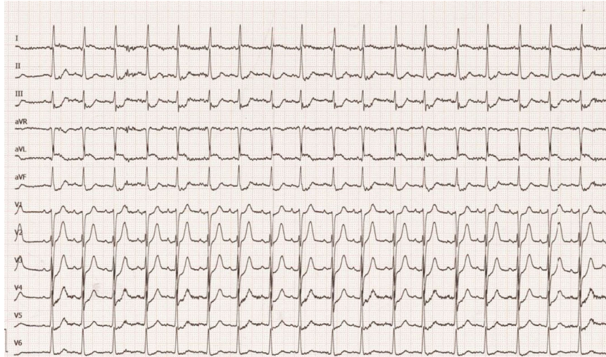
FIGURE 1: Initial ECG recording showing significant ST-segment elevations in leads I and aVL and corresponding ST-segment depressions in II, III, and aVF.