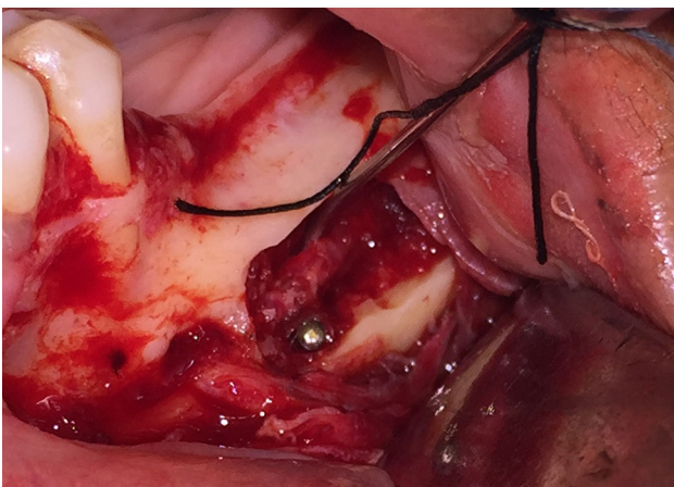
Fig. 4 Nerve lateralization

For the purpose of IAN lateralization, the corticotomy marking was done. The corticotomy started 3–4 mm distal to the mental foramen and extended in a distal direction, 1.5–2 cm distal to the provisional implant position. A small round bur in a straight hand piece with high torque and copious amount of sterile isotonic saline irrigation was used to prepare the corticotomy site. Only hand instruments