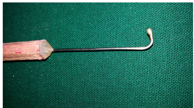
Fig. 3 MSR lateralizer

This prospective study included ten patients above the age of 18 years with an edentulous span in mandibular posterior region. It was necessary for the distance from alveolar crest to inferior alveolar nerve \leq 8 mm (CBCT) to be included in the study. Only patients opting to place