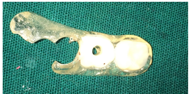
Fig. 6 Guiding stent

such as small curettes and spoon excavators were used to remove the trabecular bone and gain access to the neurovascular bundle. The IAN was mobilized from its position and released from the canal using a specially fabricated instrument. After the complete release from the canal, the inferior alveolar nerve was lateralized completely and held in position till accomplishment of immediate implant placement.