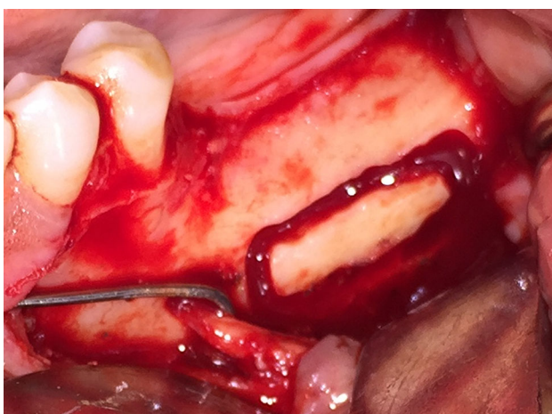
Fig. 2 Osteotomy

Inferior alveolar nerve (IAN) lateralization is a challenging surgical procedure as it involves the exposure of the neurovascular bundle from its compact bony compartment and adequate retraction while immediate placement of implant [2, 4–6]. This procedure requires good clinical experience, knowledge of the anatomy and ability to treat potential complications. Neurosensory disturbances (ND) include temporary or permanent anesthesia, paresthesia, dysesthesia and hyperesthesia of the nerve and are the single most important complication of the procedure [7–9]. The risk of fracture of the mandible is also associated due to loss of bone in the atrophied mandible. In previous studies for comparison among surgical techniques of “displacement of the foramen” and the “lateralization of the inferior alveolar nerve,” it has been found that the NDs are more in cases of displacement of the foramen (Fig. 2).