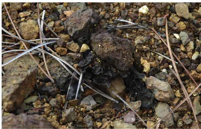
Fig. 2. Fruiting bodies of T. terrestris at the Libiola mine.

in the degraded soil of the waste-rock dump. In particular, T. terrestris (Fig. 2) is a common symbiotic ECM fungus with beneficial effects for trees growing under stressful conditions, such as those prevailing in the mine areas [20]. Moreover, this fungal species is characterised by rhizomorph formation, which increases water and phosphate uptake through a long-distance exploration mechanism [20]. Telephora terrestris is also known to solubilise zinc phosphate [11] and it confirms that this fungus can dissolve salts and probably also pyrite crystals and sulphide mineralizations [16, 17, 21]. Van Tichelen et al. [25] also showed that T. terrestris plays a central role in the P nutrition of the host plant in P-limited and Cu-contaminated soils. Several studies demonstrated that macrofungi may bioaccumulate heavy metals in their fruiting bodies, owing to enzymes or organic acids chelating metals ions and actively transporting them into the cells [11, 26, 27]. Moreover, Jongmans et al. [28] found tunnels inside mineral grains formed by hyphae of ECM fungi, which were the first indications of the role played by macrofungi in mineral dissolution, thus implying that fungi were able to dissolve mineral grains.