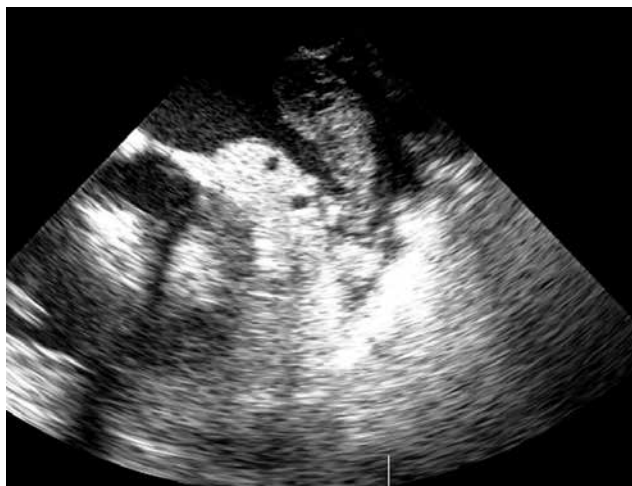
Fig. 1. Transesophageal echocardiography showing a mass attached to the left atrial appendage