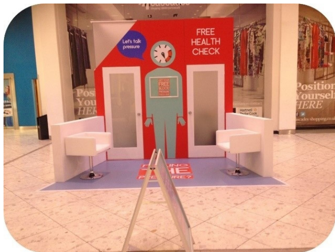
Figure 1 The 'Feeling the Pressure' Pop-Up.

is an important measurement in determining if a patient is at risk of developing glaucoma, otherwise known as a 'POAG suspect'. Elevated IOP is also associated with other forms of glaucoma, notably primary angle closure glaucoma, and IOP measurement is equally important in identifying these glaucoma suspects.