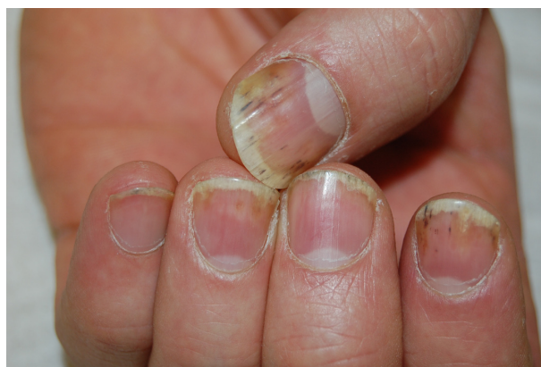
Figure 2 Nail bed psoriasis of fingernails.

shape and distribution; they may be covered by whitish, easily detachable scales. The fingernails are more often affected than the toenails. Pits may be the only manifestation of nail psoriasis or they may be associated with other signs.