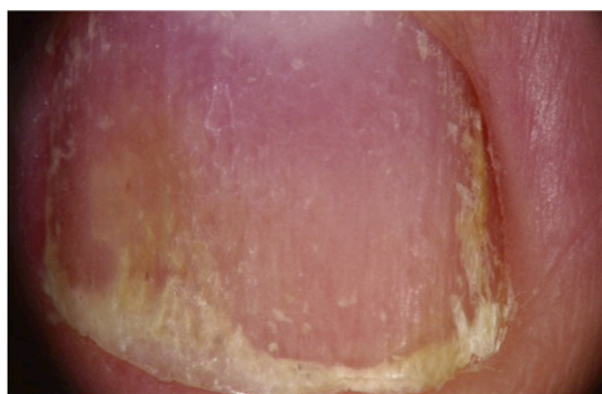
Figure 3 Enhanced visualization of pitting with dermoscopy (original magnification: \times 20 ).

Subungual hyperkeratosis describes the accumulation of scales under the distal portion of the nail plate, with nail thickening and uplifting. It most frequently involves the toenails. Splinter hemorrhages appear as longitudinal linear red-brown areas of hemorrhage, often seen in fingernails and located in the distal portion of the nail plate. They are a consequence of