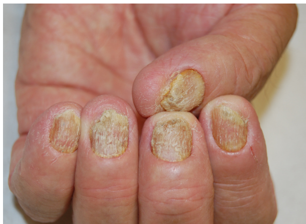
Figure 1 Nail matrix psoriasis of fingernails.

The most common sign of nail psoriasis is pitting, which is a focal defect of keratinization of the proximal matrix, with persistence of groups of nucleated and incompletely keratinized (parakeratotic) cells within the upper layers in the dorsal nail plate. These clusters poorly adhere to each other and are easily detachable, leaving pits on the surface of the nail plate. The term pitting describes the presence of small depressions on the nail plate surface 6 (Figure 3). Psoriatic pits are usually large and deep, with irregular and uneven