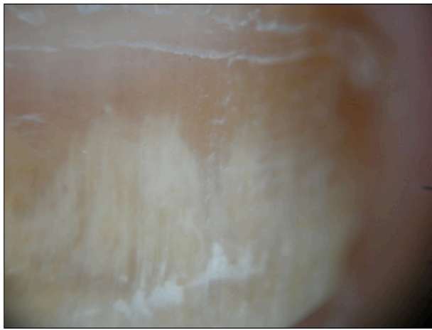
Figure 4 Enhanced visualization of onycholysis surrounded by an erythematous border with dermoscopy (original magnification: \times 20 ).

psoriatic involvement of the nail bed capillary vessels that run in a longitudinal direction along the nail bed dermal ridges. They are not specific of the disease.