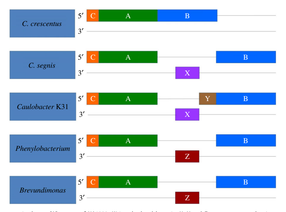
Figure 4. The gene arrangement in the gatCAB operon of NA1000, K31 and related bacteria. X, Y and Z represent genes that interrupt the operon that are not present in the NA1000 chromosome.

genes coding for exodeoxyribonuclease III and the DNA polymerase III epsilon subunit in NA1000 such that the epsilon subunit is 50 kb farther from the origin of replication in K31. The inverted region differs in size by nearly 2 kb in the two species because five separate genes are present in K31 but not in NA1000, and one gene is missing from K31 that is present in NA1000. Thus the inverted region contains at least five small indels that occurred in one of the two genomes.