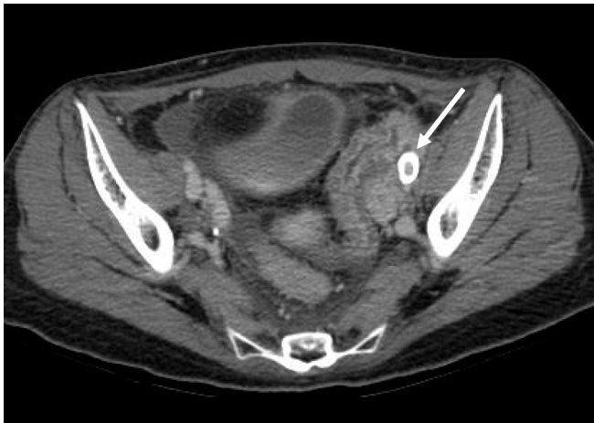
Fig. 3. Approximately 1 month later, lower extremity computed tomography venography shows a patent stent graft (arrow) in the left external iliac artery. Contrast media extravasation is not visible.