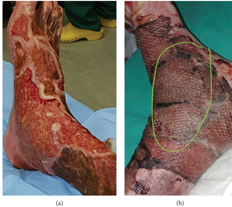
FIGURE 3: Representative images for patient 3. (a) Chronic burn wound with failed graft, overgranulation, and inflammatory margins. (b) Day 4 post widely meshed graft and PRF/spray-on skin where the wound is already reepithelialized.