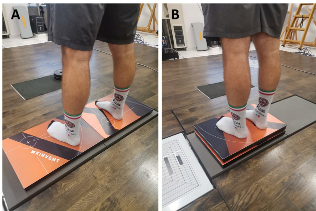
Figure 1. Experimental setups. Figure 1A depicts experimental Setup A and Figure 1B depicts experimental Setup B

Participants were verbally instructed to perform a heel strike at the start and at the end of the trial. The two pairs of devices were externally synchronized using the spike in vertical force signal from the heel strike.