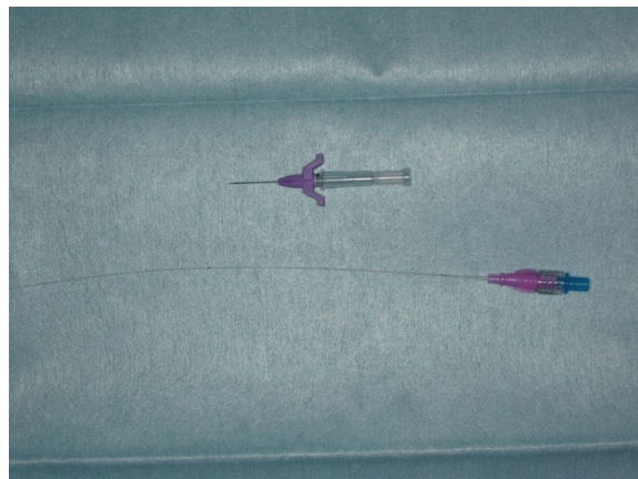
Fig. 1: Catheter for continuous transarterial heparin infusion.

For our patients, differences between preoperative and postoperative APTT were analyzed with the Mann–Whitney U test. Differences in the initial dose of bone heparin between the complication and non-complication groups were also analyzed with the Mann–Whitney U test. The ratios of the postoperative bleeding at flap recipient site between high initial heparin dose ( \geq 6.5 U/kg/h) group and low initial heparin dose ( \leq 6.4 U/kg/h) group