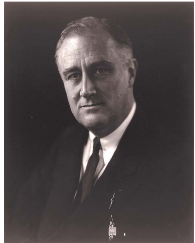
Fig. 3 Franklin Delano Roosevelt, Presidential portrait (1933).

Roosevelt arrived at the park after 9 pm and his car stopped in front of the large crowd that had been waiting for the president-elect to deliver his speech. Roosevelt sat on