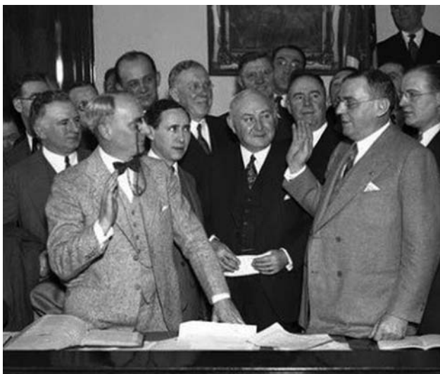
Fig. 2 Cermak sworn into office as the mayor of Chicago (April 7, 1931).

Cermak's recovery was again short-lived because he was back in Florida on January 11, 1932, this time resting