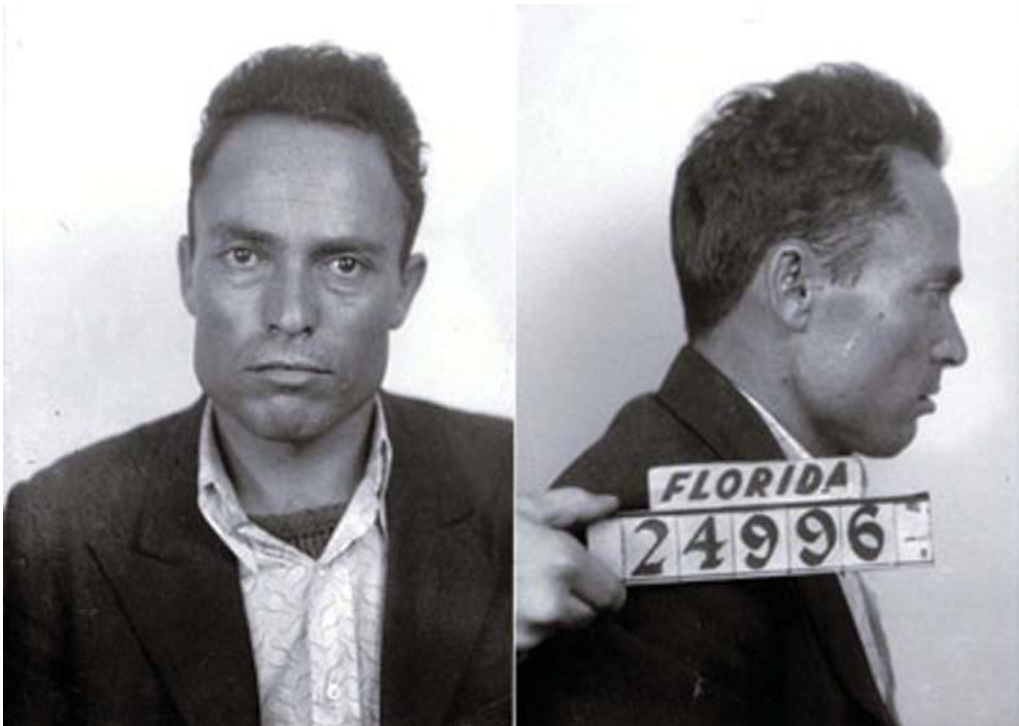
Fig. 4 Giuseppe Zangara, mugshot Florida Department of Corrections.

the top of the back seat of his convertible to give his 1-minute speech around 9:40 p.m. After the speech, Cermak, who was sitting with other dignitaries just steps away from the convertible, moved to the running board to shake hands and speak with the president-elect. After speaking with Roosevelt, as Cermak moved away from the convertible, Giuseppe Zangara fired five shots in an attempt to assassinate Roosevelt. 24