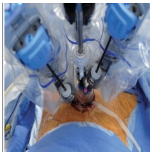
Figure 2. R-LESS set up.

The surgical technique follows the steps previously described [2]. The single port device is a multichannel disposable specific for the da Vinci Surgical system with space for four cannulae and an insufflation valve (Figure 2). The specific cannulae used are: two 5 mm × 250 mm-long curved cannulae for robotic flexible instruments, one cannula for 8 mm endoscope and one 5 or 10 mm laparoscopic cannulae for the bedside assistant surgeon.