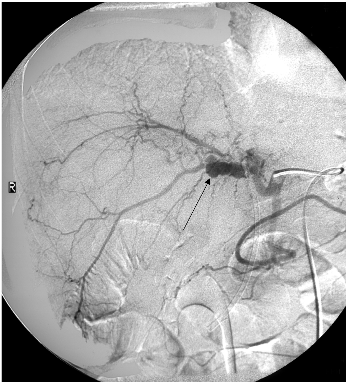
Figure 2 Hepatic angiogram. Black arrow, pseudoaneurysm.

biliary fistula and obstruction to biliary drainage [7]. Differentiating Mirizzi syndrome from gallbladder cancer or cholangiocarcinoma is a well-recognised problem and it