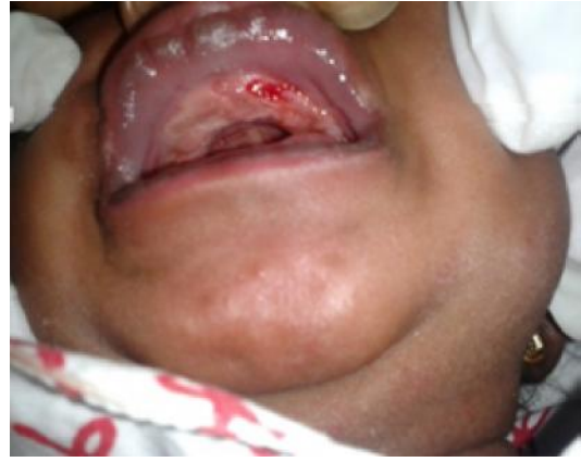
Immediate intra-operative clinical picture