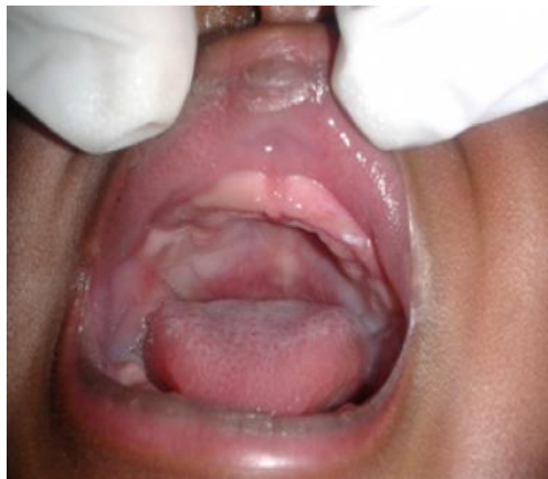
A month post-operative clinical picture

local anaesthesia and the patient was discharged and followed-up. Histopathologic evaluation revealed the mass to be congenital granular cell tumour of the newborn.