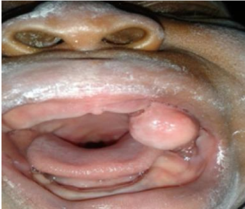
Pre-operative clinical picture