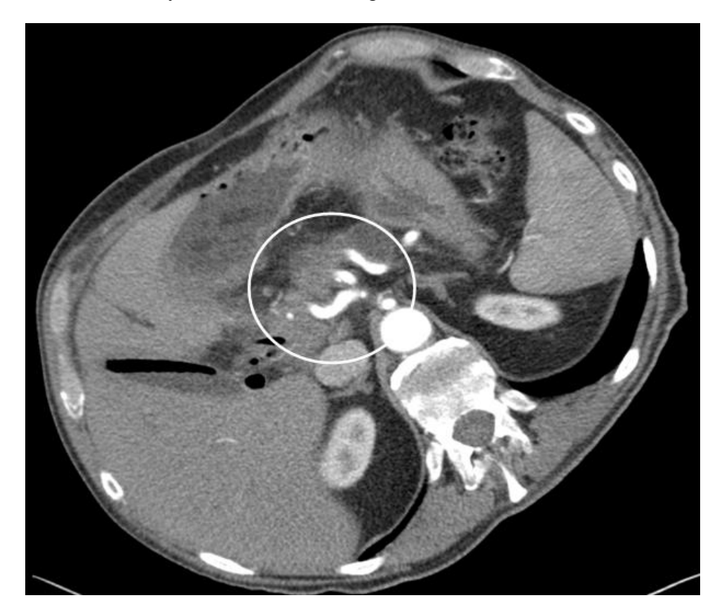
Figure 3. CT scan showing pancreatic head cancer with infiltration of the celiac trunk. Infiltration of common hepatic, left gastric and splenic artery (white circle, left, middle and right vessel). Technically not resectable finding.

However, arterial resections have to be evaluated differently in pancreatico-duodenectomy or distal pancreatectomy. This also implies the differentiation of resection without re-vascularization and resection with direct anastomosis or graft insertion to replace the resected vessel. In a recent review, the role of arterial resection has been critically evaluated including all currently available studies [68].