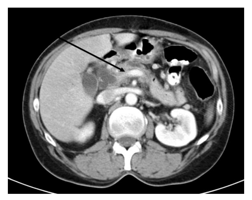
Figure 2. CT scan showing pancreatic head cancer with infiltration of the portal vein confluens (black arrow). Technically resectable finding (partial duodeno-pancreatectomy with segmental portal vein resection).

Depending on the localization and growth pattern of the tumor, two types of adherence or infiltration of vascular structures need to be regarded: Venous vessel involvement of the superior mesenteric and/or portal vein and involvement of the celiac trunk or the superior mesenteric artery as the major upper GI arterial vessels (Figure 2).