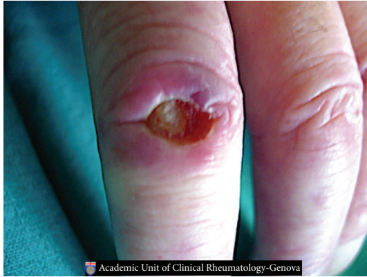
FIGURE 3: Classical skin digital ulcer in a patient affected by systemic sclerosis.

Another recent investigation showed that a quantitative capillaroscopic score was suggested highly predictive of the development of new skin DU within 3 months after NVC [22]. The predictive value of this index still needs to be confirmed in a validation study.