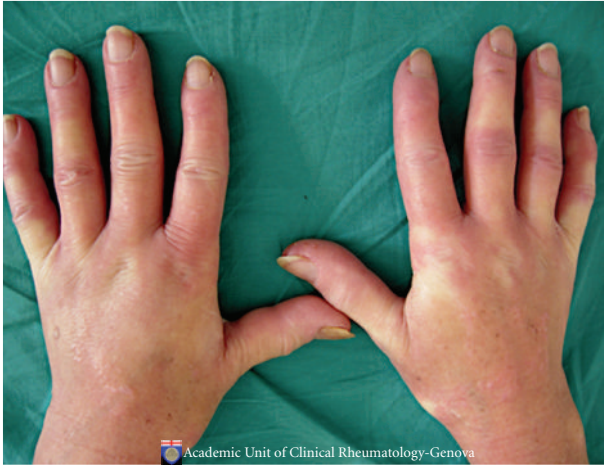
FIGURE 1: Hands of a patient with early systemic sclerosis suffering from secondary Raynaud's phenomenon.

and/or eventually scores. The 3 important biological/clinical conditions are: the SSc-specific serum autoantibodies, the SSc skin digital ulcers (DUs), and the pulmonary arterial hypertension (PAH) associated to SSc.