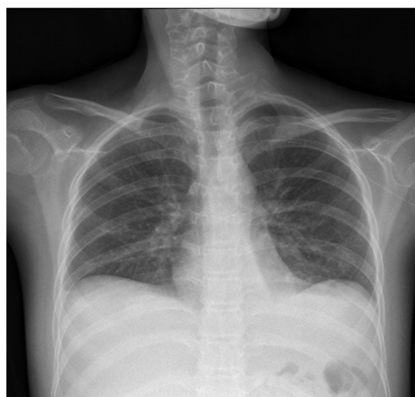
Figure 4. Chest radiograph of case 4.

A 13-year-old girl was transferred to our institution on 26 April 2018, with a history of NS lasting for 1-month. She was initially treated with intravenous methylprednisolone 60 mg qd (1.5 mg/kg). Initial laboratories of peripheral blood included ALB 14.0 g/L, CHOL 9.8 mmol/L, CREA 95 \mu\text{mol/L} (CCr was 64.28 mL/min/1.73 \text{m}^2 ). 24-h urine protein was 13.470 g. CMV DNA was detected in blood (7550 copies/mL) but negative in urine. Because of a large amount of ascites and poor diuretic effect, abdominal puncture was performed on 28 April 2018. The routine biochemical screening tests of ascites are shown in Table 1. Cultures of the specimen produced no growth of fungi, mycobacteria, or bacteria and EBV DNA was negative in ascites. CMV DNA was detected in ascites (769 copies/mL). Therefore, the girl was treated with intravenous GCV (the dose was adjusted for renal function: 2.5 mg/kg, q12h). On 4 May 2018, the child had abdominal pain, cough, and expectoration without fever, vomiting or diarrhea. Physical examination revealed normal vital signs, severe facial and lower limbs edema. There were rales at auscultation of both lungs. Abdominal examination showed bulging flanks, generalized tenderness and rebound tenderness, shifting dullness. Laboratories of peripheral blood included WBC 10.70 \times 10^9/\text{L} (NEUT 63.2%; LY 30.4%), normal