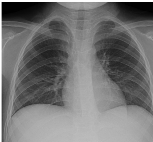
Figure 2. Chest radiograph of case 2.