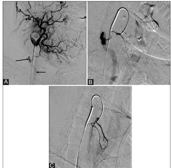
Figure 2 (A-C): Pseudoaneurysm and arteriovenous fistula treated with coiling. (A) Right ECA angiogram, lateral projection (late arterial phase) showing a pseudoaneurysm (long arrow) arising from a branch of the right superior thyroid artery. Early filling of a venous channel is also seen (short arrow), confirming the presence of a fistula (B) Superselective angiogram of the right superior thyroid artery demonstrating the pseudoaneurysm and the arteriovenous fistula (C) Post-coiling angiogram of the right superior thyroid artery showing complete occlusion of the pseudoaneurysm and the arteriovenous fistula

Common and selective right external carotid artery angiograms showed a small pseudoaneurysm arising from the sternocleidomastoid branch of the right superior thyroid artery, with associated arteriovenous fistula [Figure 2A and B] draining into a venous collateral. The involved artery was superselectively cannulated with a microcatheter (Progreat Microcatheter System; Terumo, Tokyo, Japan) and embolized with two 2 mm x 2 cm, 0.18-inch fibered platinum pushable coils (Hilal; Cook, Washington, USA). Post-embolization check angiogram showed complete occlusion of the pseudoaneurysm and the arteriovenous fistula [Figure 2C]. The neck hematoma started reducing over the next 48 h and was almost completely resolved clinically by the end of 1 week.