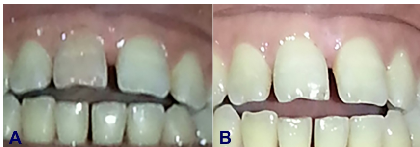
Figure 1. Tooth before (A) and after (B) bleaching.