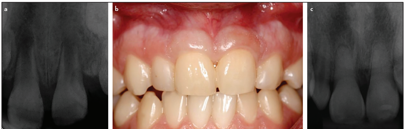
Figure 1. a-c. (a) Initial radiographic exam after dental replantation, (b) clinical aspect of maxillary central incisors at five years post-trauma, (c) radiography evaluation at 60 months

The mucoperiosteal flap was sutured in position, and a periapical radiograph was taken to confirm the accuracy of the retrograde filling of tooth 11. The post-operative period was un-