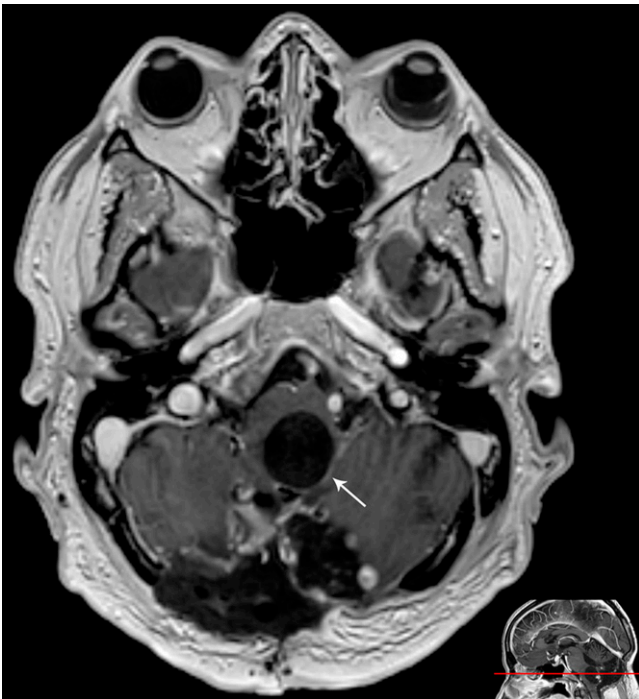
FIG. 2. Presurgical axial, gadolinium contrast-enhanced, T1-weighted MRI. The white arrow points to the primary cystic process.

The planned postsurgical MRI revealed that the cyst compressing the brainstem was unchanged, and repeated surgery was scheduled. During the second surgery, the cyst was localized and fenestrated. Further exploration was discouraged because the patient had several events of severe bradycardia during surgery. The following day, the patient was fully awake and without new neurological